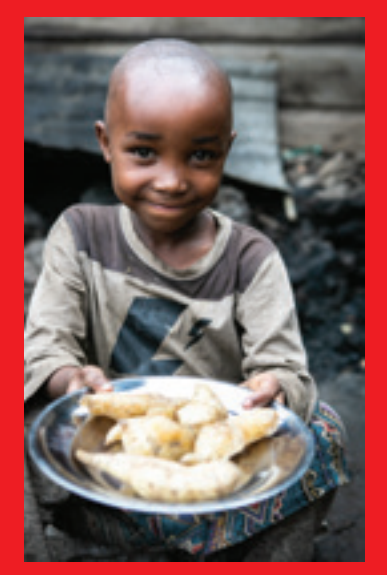
EMERGENCY FOOD $50