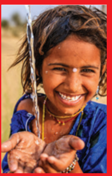
SCHOOL WATER PROJECT $125