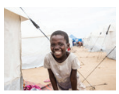
AND EMERGENCIES Pages 9-11 Provide children affected by conflict and climate disasters