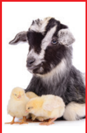
1 GOAT + 2 CHICKS $75