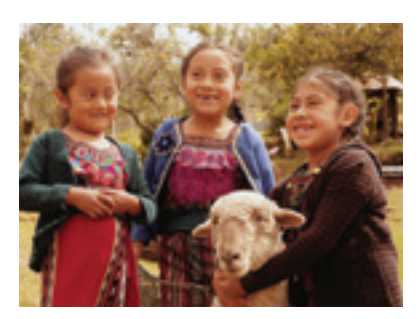
SUSTAINABILITY Pages 6-8 Help children's farms grow and produce healthy harvests.